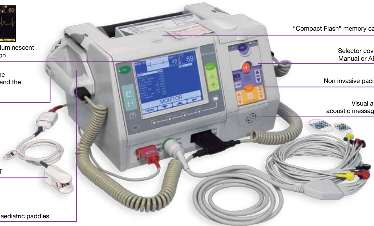
Visual and acoustic messages