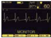
"EL" electroluminescent display option